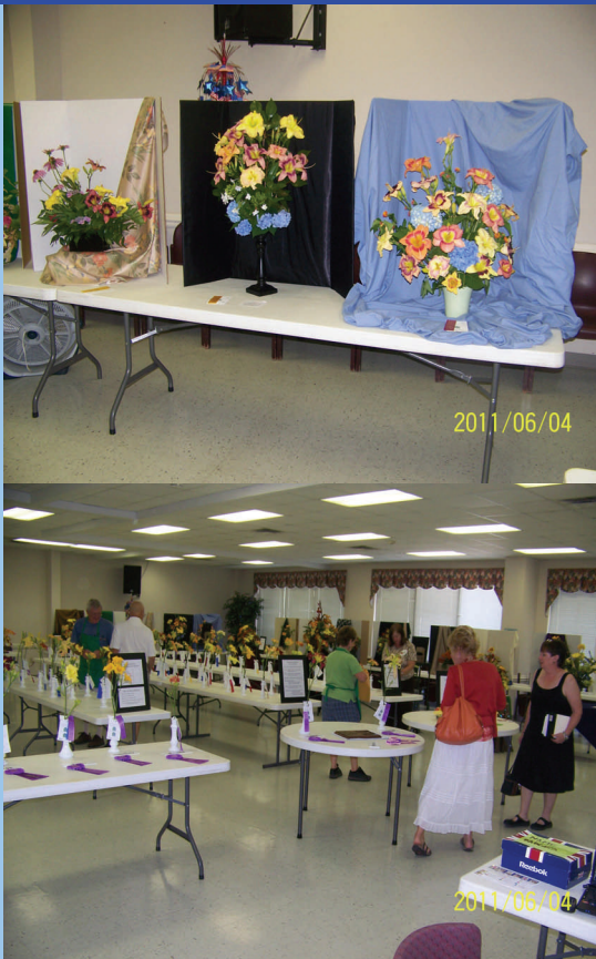
The annual Daylily Show took place on June 4, 2011 in the h2u activities room. It was a huge success.